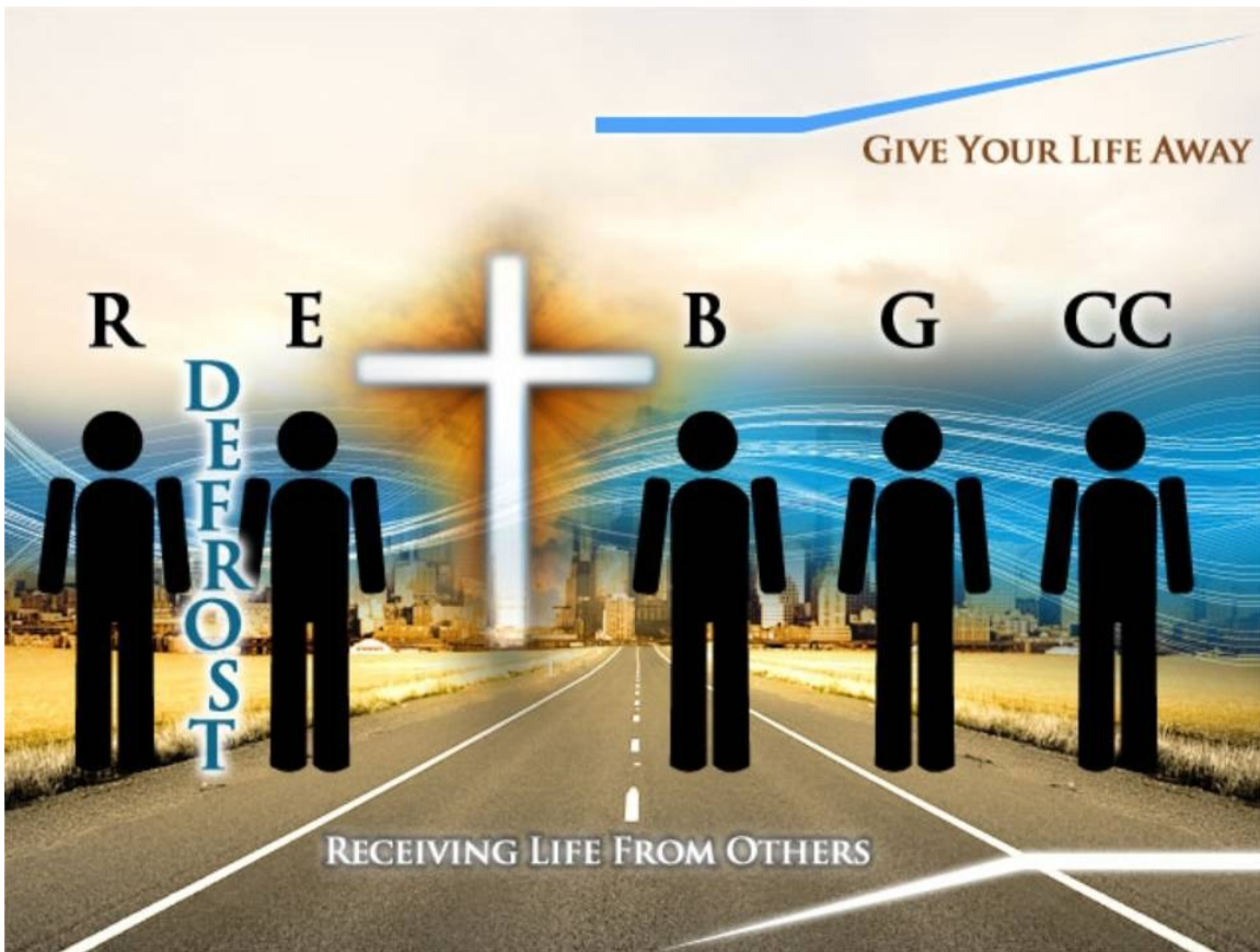
Chart 2: Spiritual Life Journey

It is our intention to ensure that all County Line ministries and activities are designed and implemented in a way that will move individuals along their spiritual journey to becoming ever more Christ-centered.